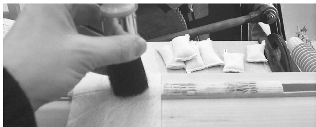
Fig. 3. Spine is cleaned and lined with Japanese tissue.