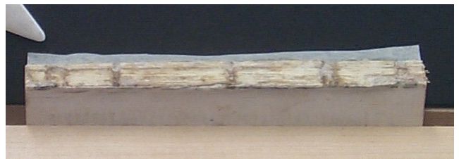
Fig. 1. Free flange is created by extending spine lining.

In conclusion I would like to restate that we try to save original sewing structures whenever feasible. There are many decisions to make within the context of the demands placed upon us by the collections, our users, and ultimately our institutions. My presentation today reflects a