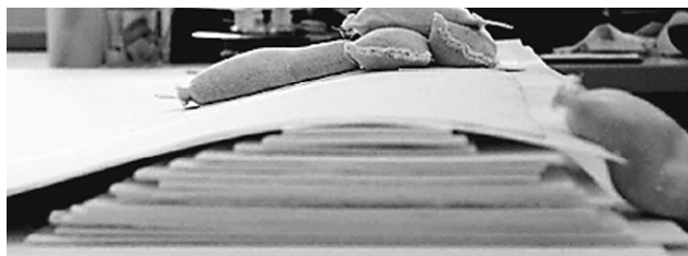
Fig. 2. Convex support board

This paper was presented as a poster at AIC 32nd Annual Meeting, June 9–14, 2004, Portland, Oregon. Received for publication Fall 2004. Color images for this paper are available online at http://aic.stanford.edu/bpg/annual/ .