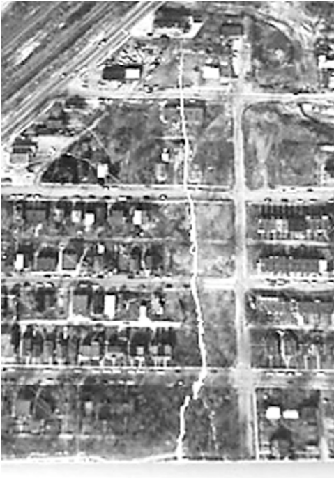
Fig. 3. Improperly aligned mend