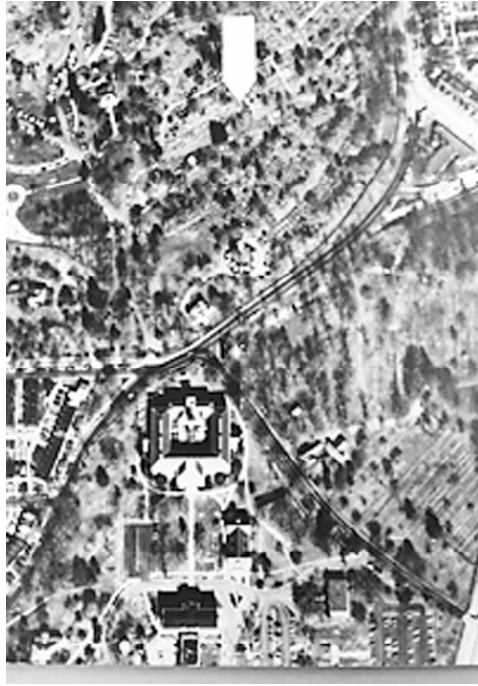
Fig. 4. Properly aligned mend just visible below the arrow

hardly visible. Again, no inpainting was done. Using this technique, the mended prints did not suffer from any local distortions as the two sides of the tear were reunited. The tears mended in this fashion were quite strong and did not fail when the photographs were flexed or held flat.